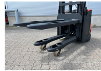
TOYOTA Werksüberholt / Factory refurbished