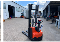
TOYOTA Werksüberholt / Factory refurbished