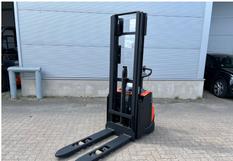
TOYOTA Werksüberholt / Factory refurbished

We expressly point out that the above statements on the device do not represent any represent warranted characteristics. These are to be inquired directly with the responsible salesman in our house. However, only the information/properties according to the content of the purchase contract are ultimately relevant.