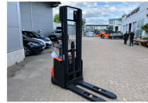
TOYOTA Werksüberholt / Factory refurbished