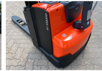
TOYOTA Werksüberholt / Factory refurbished

Price: 5.950,00 € (excl. VAT.) (Subject to prior sale)